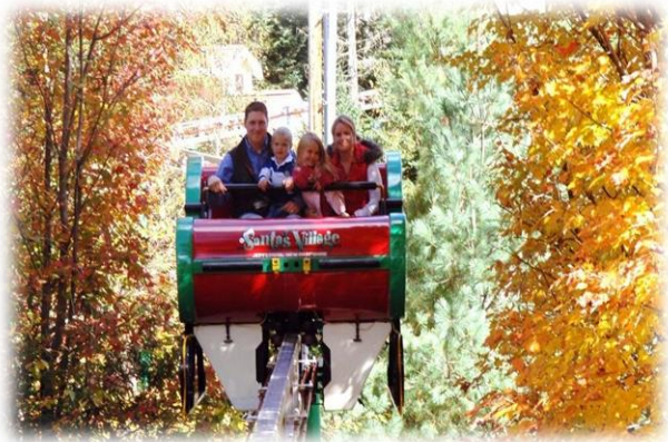
Day 16 Sunday 25 February 2024 SINETTA