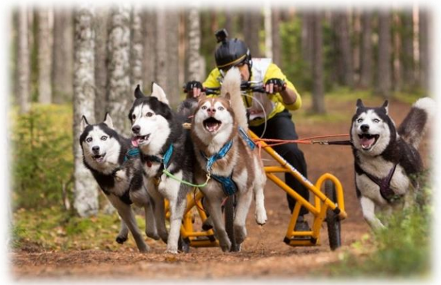
Day 13 Thursday 22 February 2024 SAARISELKA