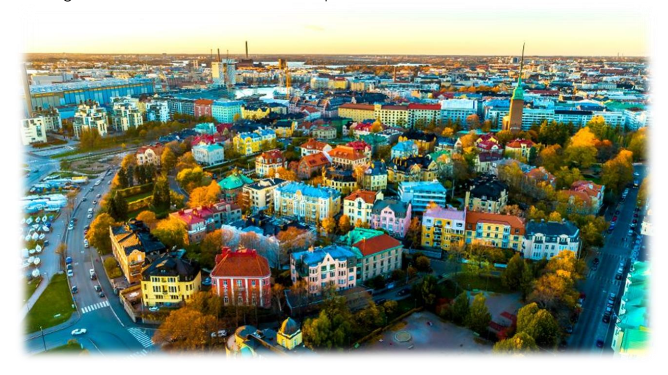
Day 18 Tuesday 27 February 2024 HELSINKI

Transfer to station for the overnight train from Rovaniemi to Helsinki – Overnight train – includes train cabins with private bathroom.