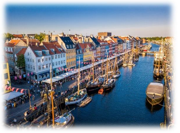
Day 20 Thursday 29 February 2024 COPENHAGEN