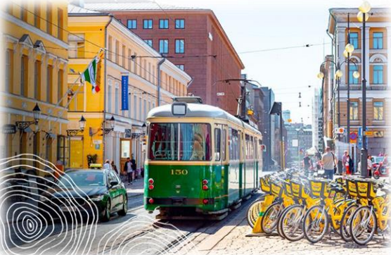
Day 19 Wednesday 28 February 2024 HELSINKI - COPENHAGEN