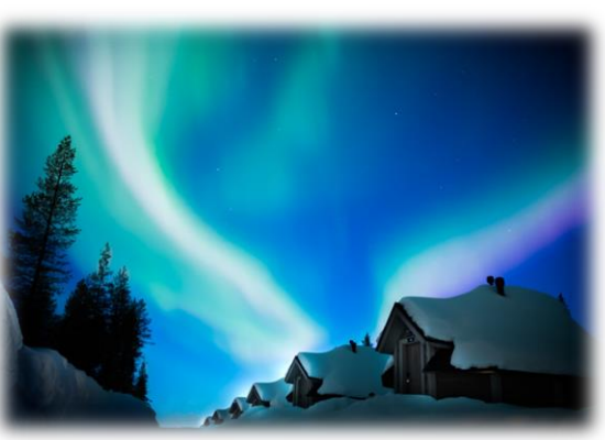
Day 15 Saturday 24 February 2024 SINETTA